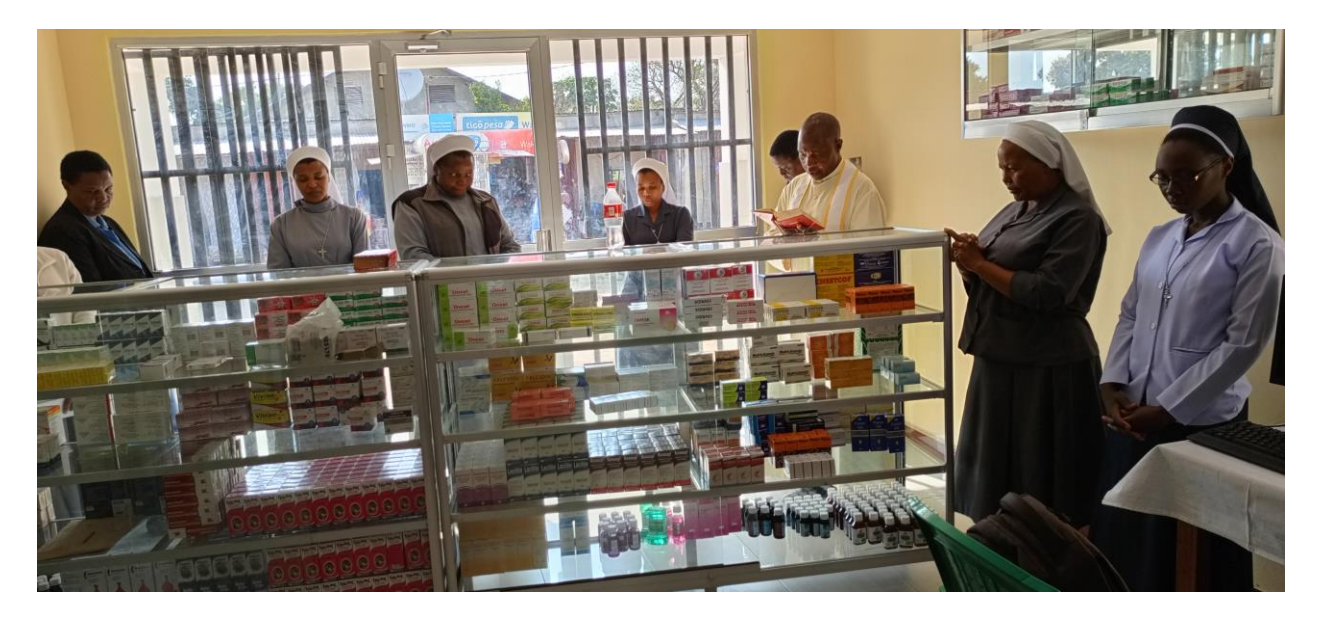
Fig 3: The Blessing prayer for the pharmacy and the drugs before the official opening.