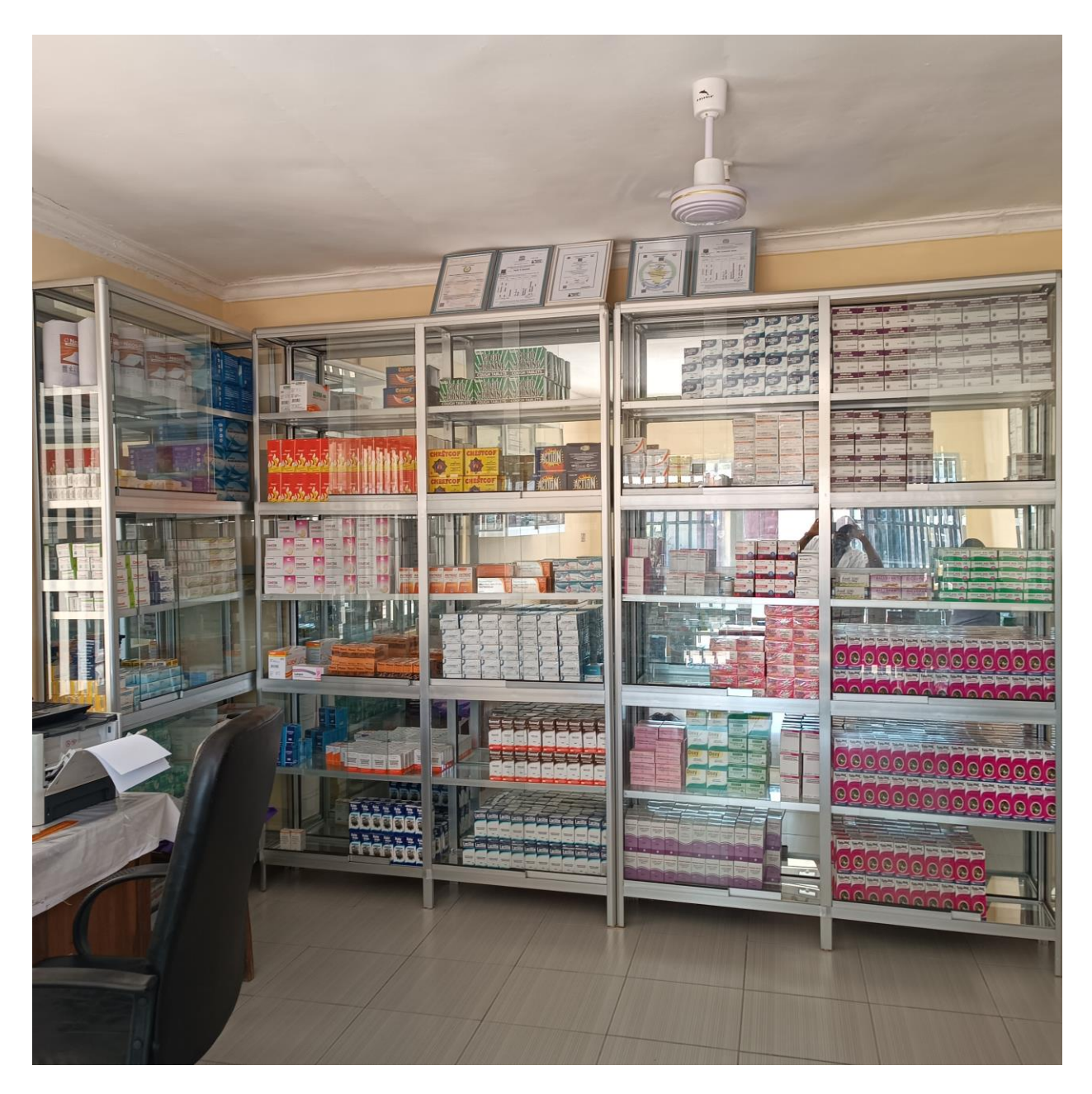
Fig 6: Drugs in the shelves