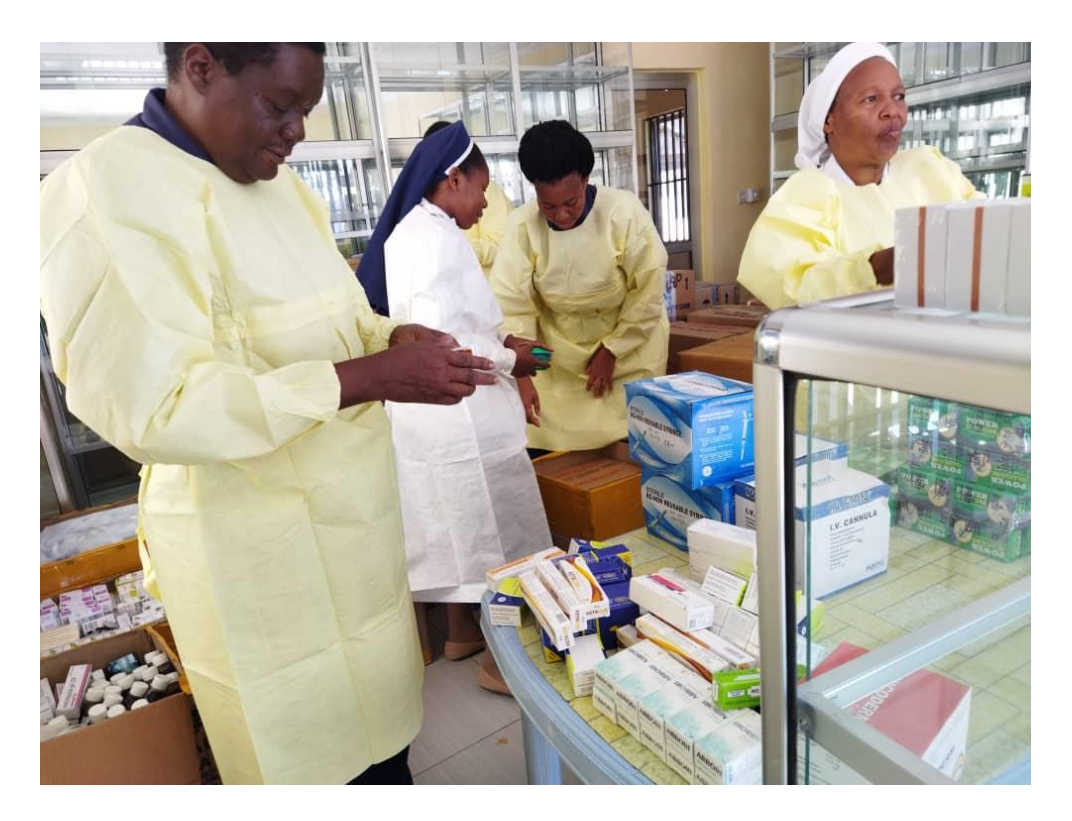
Fig.1: the process of sorting drugs